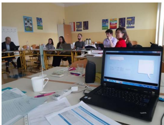
The 3 rd transnational meeting took place in Zalec (Slovenia), hosted by UPI-LJUDSKA UNIVERZA ŽALEC