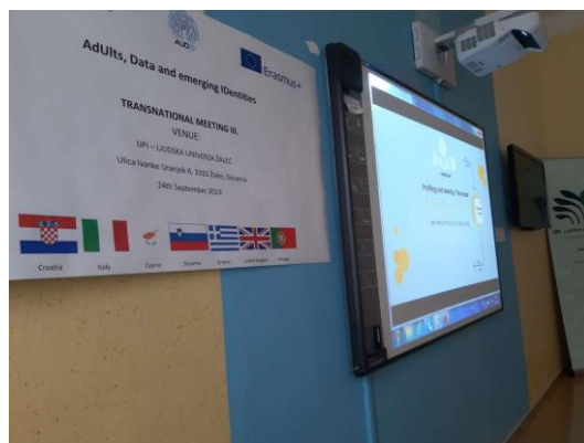
The 3 rd transnational meeting of AUDID – ADults, Data and emerging IDentities

Following the progress evaluation of the Online Environment, CIVIC proceeded with presenting the first version of the Dynamic Demonstrator; a digital tool comprising of introductions to each module, real-life scenarios and last but not least, the references used for producing each module and case. The meeting agenda also included the review of the Open Badges validation system and the ‘Academy Virtual Space’ specificities. Representatives from COIN re-addressed the purpose of the Intellectual Output as a whole along with its mission to act as a feature of live support to both the direct and indirect target groups.